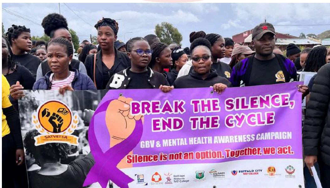
Ingwe TVET College

The event exceeded expectations, featuring a march to Sterkspruit Police Station, where a memorandum on student safety was handed in and accepted by the Station Commander. Future programs include an Anti-Drug and Gambling campaign, addressing substance abuse and NSFAS fund misuse amongst students .