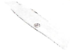
Standard knife with internal blade storage ,zinc alloy construction

Signed by Lecturer N. Nganda Name NGANDA N Date 04/09/2023